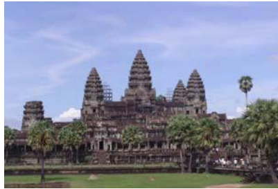
Angkor Vat temple in Cambodia

The monitoring of deformations and temperatures of selected temples showed that the difference between the maximum and minimum temperature on intensely insulated ex-